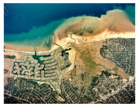
Aerial photo of the Upper Truckee marsh at Lake Tahoe.