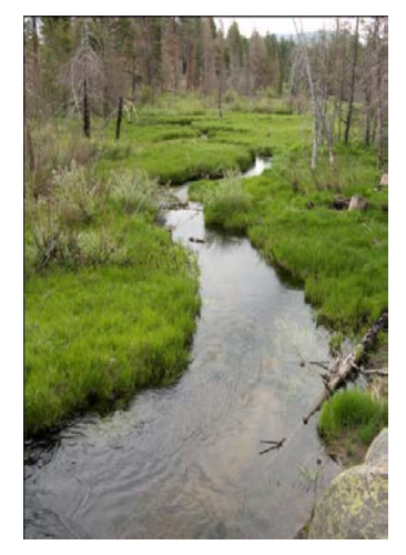
Stream-meadow complex, Angora Creek, South Lake Tahoe, CA.

What impact have restoration efforts had on reducing the delivery of fine sediment to lake and restoring lake clarity?