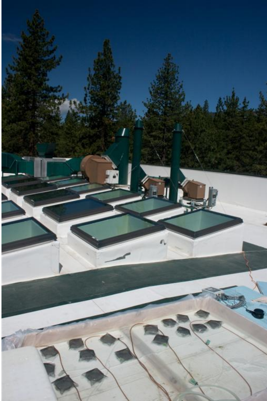
Figure 3. UV exposure experiments on the roof top of TCES with fish larvae