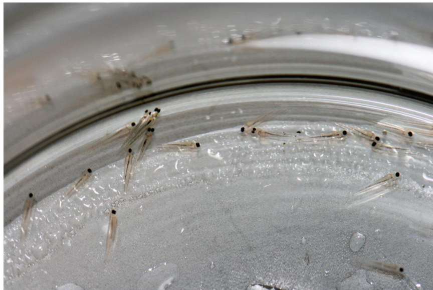
Figure 4. Fish larvae, Lahontan redbside shiner-native to Lake Tahoe (top) and largemouth bass-nonnative to Lake Tahoe