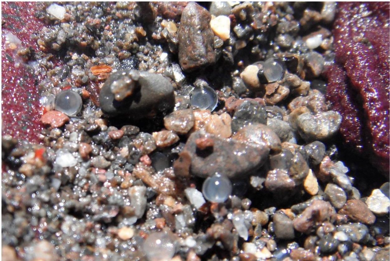
Figure 2. Lahontan redbside shiner fish eggs in gravel